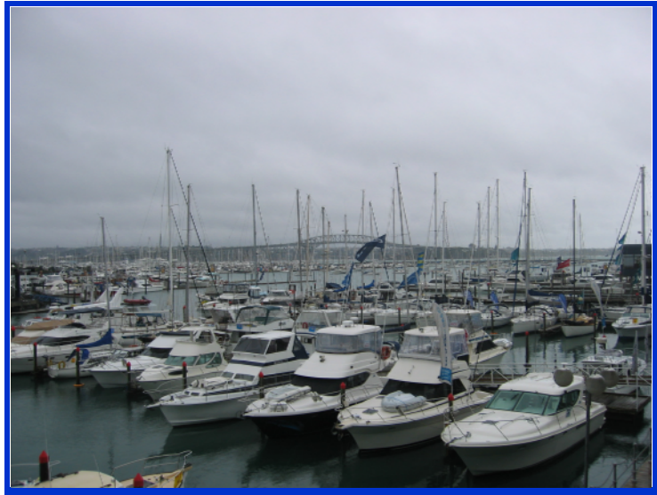
A cold and wet winter day outside our design studio.