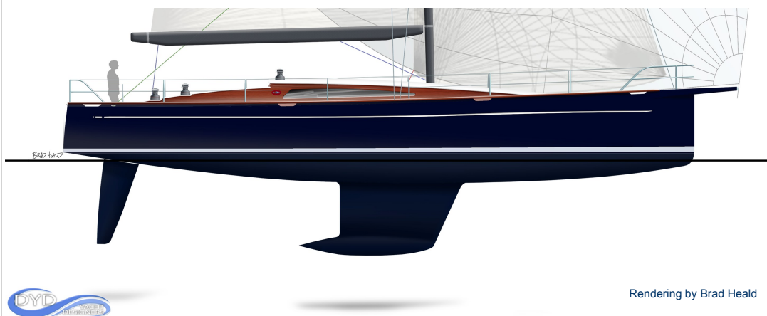
Rendering by Brad Heald

This is only an introduction to this project as we are putting together a more detailed Newsletter dedicated solely to this yacht over the next couple of weeks.