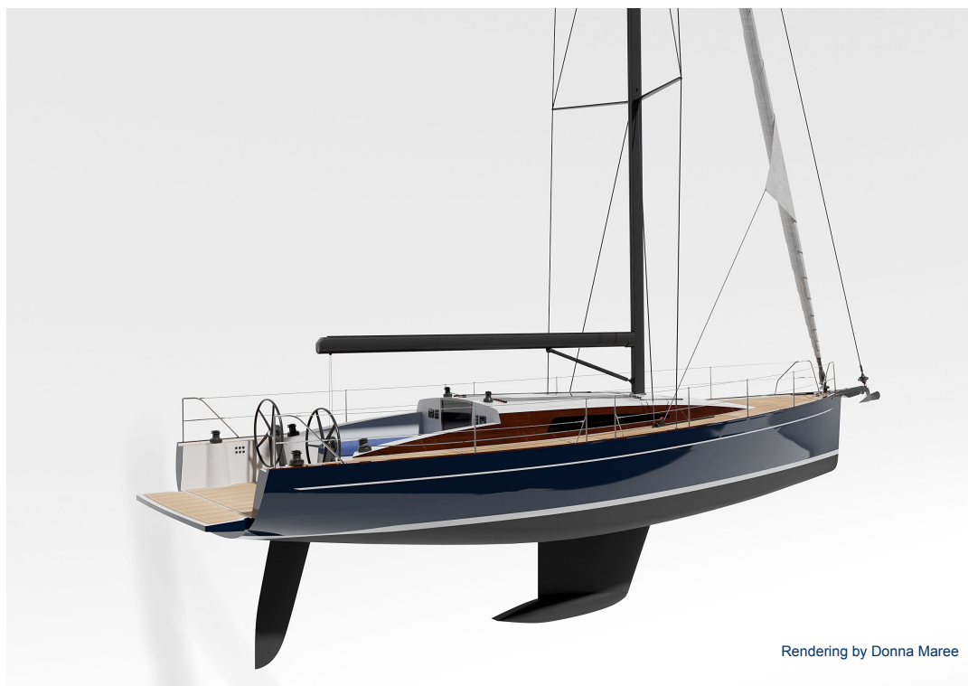
Rendering by Donna Maree

Over the last 6-months we have been working closely with Cabot Lyman and the Lyman-Morse yard on a 46-foot semi production performance cruising yacht that would appeal to the modern sailor but have that soul aspect that only a wooden yacht can achieve.