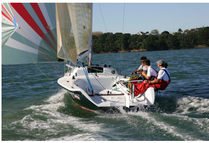
Dibley 25 "Carbon' in her element.

Earlier last month, the Dibley 25 ' Carbon ' found a new home on Bainbridge Island, just to the west of Seattle. Designed in 1995, she went through a complete refit with a new lifting keel, Harken Deck package, Doyle (NZ) sails as well as a super-yacht level fairing and paint job, inside and out.