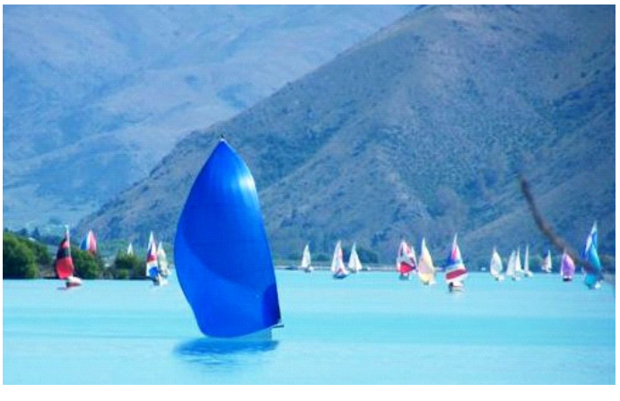
Dibley 8 'Springloaded' in drifting conditions but huge lead.

Bainbridge Island, in the heart of the Puget Sounds, is known for its light air regattas during the summer, and the heavy air cold fronts during the winter race season. 'Carbon' has done very well under both conditions and should excel in their local fleet racing. A new 2011 hull shape and sail plan is currently on the drawing table, which takes advantage of Dibley Marines VPP software and other design tools that were not around when 'Carbon' was originally drawn.