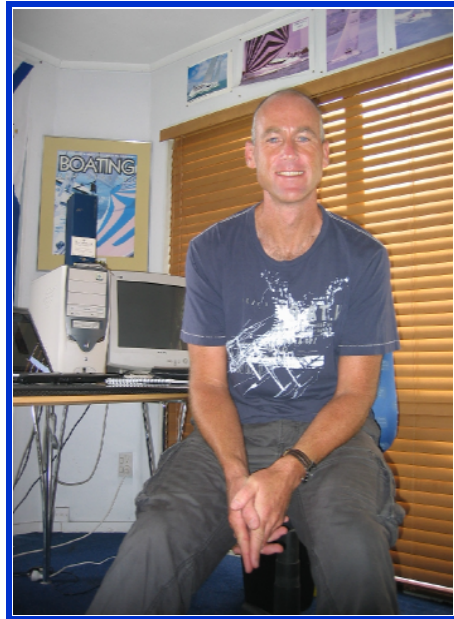
Fall, Auckland, 2009

FROM THE DESIGN OFFICE: The design office continues to churn out the work. This quarter seems to be Powerboat design orientated as opposed to Sailing Yacht, but that happens in this industry where a design office tries not to 'specialize' on any particular path. One of the projects on our design table is a 30-meter Luxury Launch for clients in the Caspian Sea. Draft is a big issue in this big expanse of water and the more saved below, can limit what goes on top. It's a 'design spiral' that is a constant in a yacht designers life, and we'll look at this aspect of the design process in future newsletters. I hope you enjoy the updates. Happy Boating.