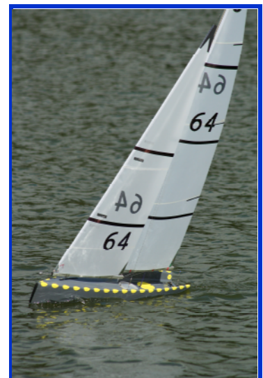
Graham Cross's NZ 64, Auckland, NZ