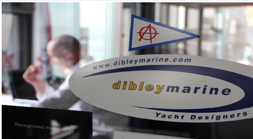
Dibley Marine Design Studio, Westhaven Marina, Auckland, NZ , July, 2013